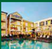
克尼斯纳 Protea Hotel by Marriott (2 晚) ★★★★★☆