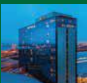
开普敦 The Westin (2 晚) ★★★★★☆