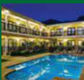
弗朗斯胡克 Protea Hotel by Marriott Franschhoek (1 晚) ★★★★★☆