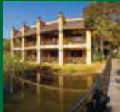
维多利亚瀑布 The Kingdom Hotel (3 晚) ★★★★★☆