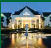
乔治 Protea Hotel King George (1 晚) ★★★★★☆