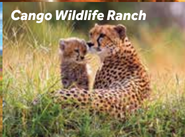
Cango Wildlife Ranch