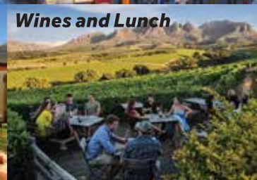
Wines and Lunch