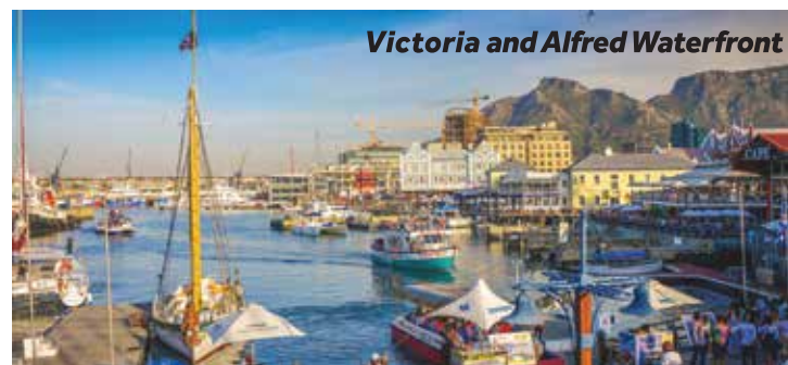
Victoria and Alfred Waterfront