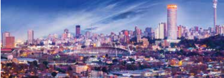
Johannesburg, South Africa

Transfer to Victoria Falls Airport for flight to Johannesburg, South Africa . On arrival proceed Johannesburg orientation Tour .