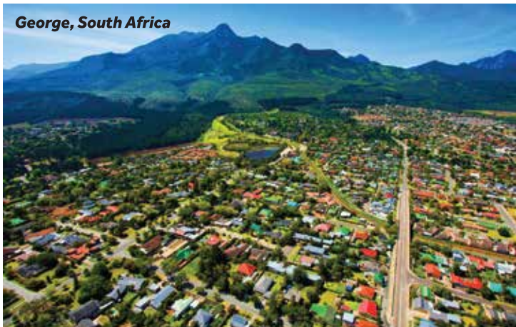
George, South Africa

Explore Tsitsikama National Park's spectacular scenery including the Indian Ocean breakers. Rocky shores beneath 180m highcliffs, evergreen forests and fynbos rolling down to the sea.