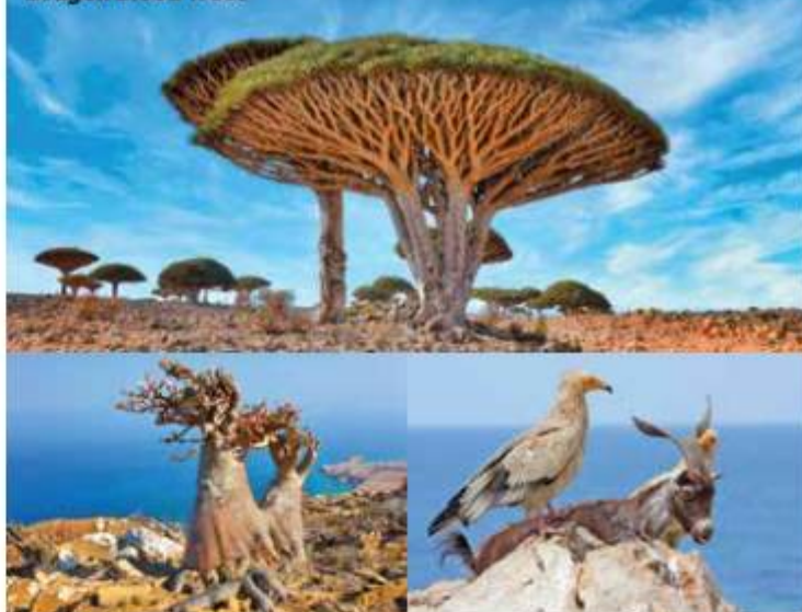
Dragon Blood Trees