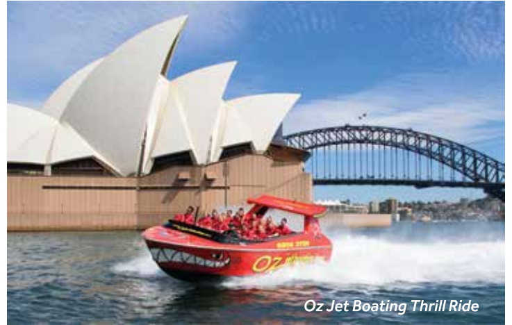
Oz Jet Boating Thrill Ride

Kick-start the day from the Royal Botanic Gardens with photostop at Mrs Macquarie's Chair for a superb bird's eye view of the beautiful Sydney Harbour . View the historic & iconic Queen Victoria Building in the center of Sydney. Lunch own expense at Sydney Fish Market , the largest market of its kind in the Southern Hemisphere with its huge variety of fresh seafood.