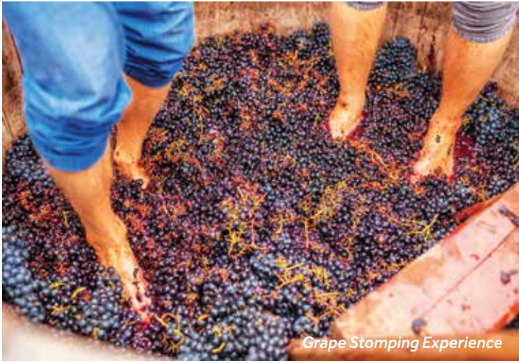
Grape Stomping Experience

🍴 Hotel Breakfast / Wine Tasting & Lunch /-