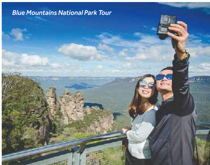
Blue Mountains National Park Tour

Entrance to Scenic World , ride the world's steepest Scenic Railway down to the canopy of ancient rainforest below, hop on the Scenic Cableway to enjoy the breath taking panoramic view of the landscape. Scenic Skyway is a must for exploration, it offers the best view of Katoomba Falls through the glass floor. Visit Echo Point for world famous Three Sisters , a set of unusual rock formations that stand tall above the forest.