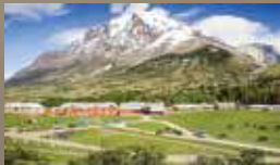
托雷斯德爾潘恩 Hotel del Paine 4* 或同級 (2 晚) ★★★★★☆