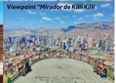
Viewpoint "Mirador de Killi Killi"