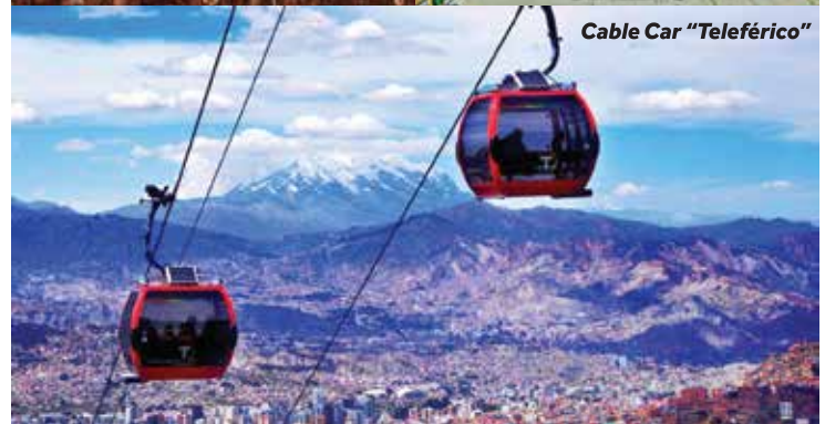
Cable Car "Teleférico"