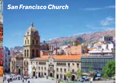
San Francisco Church