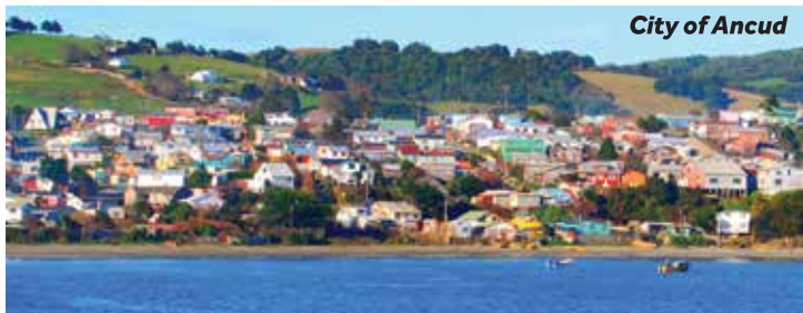
City of Ancud

Dock in the town of Chacao to the city of Ancud and visit the Fort of San Antonio .