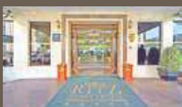
拉巴斯 Ritz Apart Hotel La Paz 4* 或同級 (1 晚) ★★★★★☆