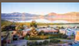
普諾 Casa Andina Premium 4* 或同級 (1 晚) ★★★★★☆