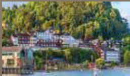
巴拉斯港 Hotel Cabana del Lago 4* 或同級 (2 晚) ★★★★★☆