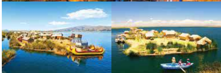
Floating reed islands of the Uros Indians