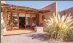
聖佩德羅德阿塔卡馬 Hotel Cumbres San Pedro de Atacama 4* 或同級 (2 晚) ★★★★★☆