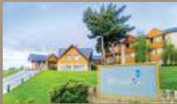
埃爾卡拉法特 Hotel Mirador del Lago 4* 或同級 (2 晚) ★★★★★☆