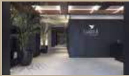
布宜諾斯艾利斯 Gardi Hotel & Suites 4* 或同級 (1 晚) ★★★★★☆