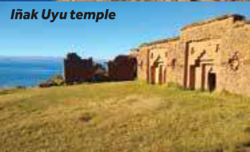
Iñak Uyu temple