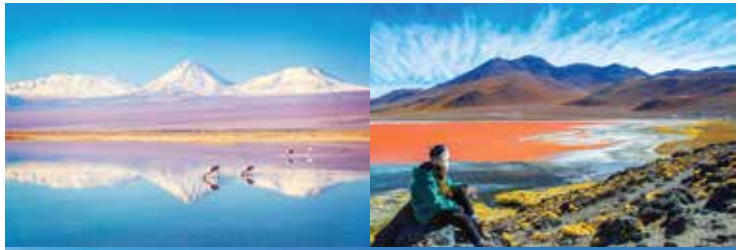
San Pedro de Atacama

Transfer to airport for flight to Calama before transferring to San Pedro de Atacama . This oasis in lies in the heart of northern Chile's most spectacular scenery, offering the country's largest salt flat, its edges crinkled by volcanoes. Here too are fields of steaming geysers, otherworldly rock formations and weird layer-cake landscapes. Free at leisure.