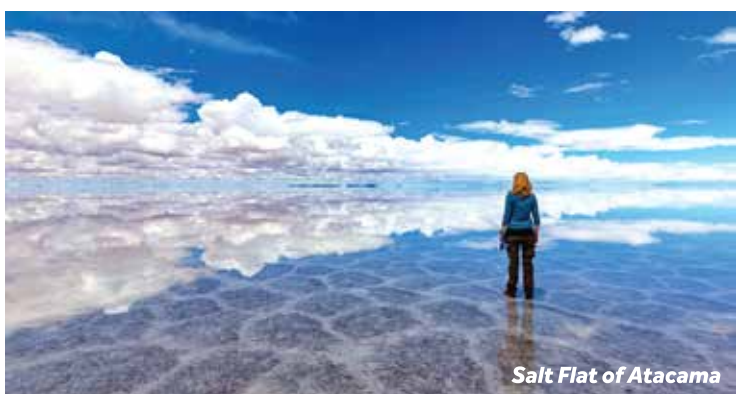
Salt Flat of Atacama

On the Soncor Sector of the vast Salt Flat of Atacama, one of the seven spots on the Flamingo National Preservation, stop at Chaxa Lagoon where you will find bird wildlife such as the 3 different types of Flamingos present in this country as well as a breathtaking view to the lagoon creating a mirror effect that reflects the Sky and the mountains.