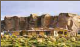
維拉瑪 Mallku Cueva Hotel 4* 或同級 (1 晚) ★★★★★☆