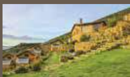
烏魯斯群島 Ecolodge La Estancia 4* 或同級 (1 晚) ★★★★★☆