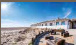
科爾查尼 Hotel de Sal Luna Salada 4* 或同級 (2 晚) ★★★★★☆