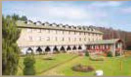
巴里洛切 Hotel Panamericano Bariloche 4* 或同級 (2 晚) ★★★★★☆