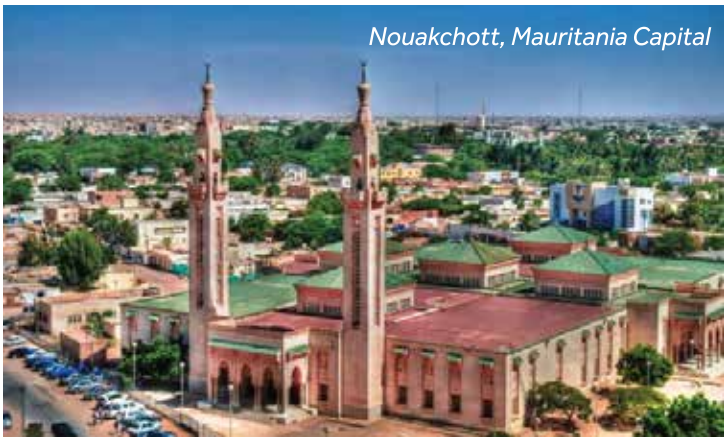
Nouakchott, Mauritania Capital

The world is slowly hearing about Mauritania with one of the world's lowest population densities and rising tourist gem. It is the 11th largest country in Africa bordered by the Atlantic Ocean to the west & the Western Sahara to the north and northwest.