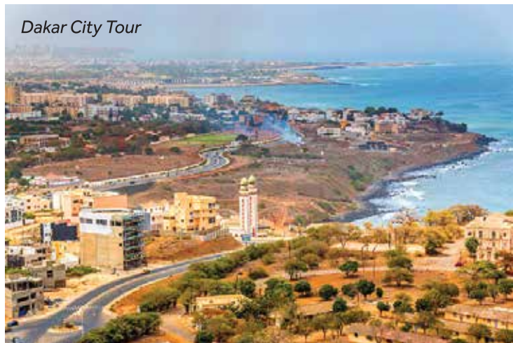
Dakar City Tour

Transfer to airport for flight to Dakar , capital of Senegal. Dakar city tour – visit the "Plateau" district, Railway station, City Hall, Independence square, Presidential Palace and the renaissance African monument with a stop at Soumbédioune Artisanal Market .