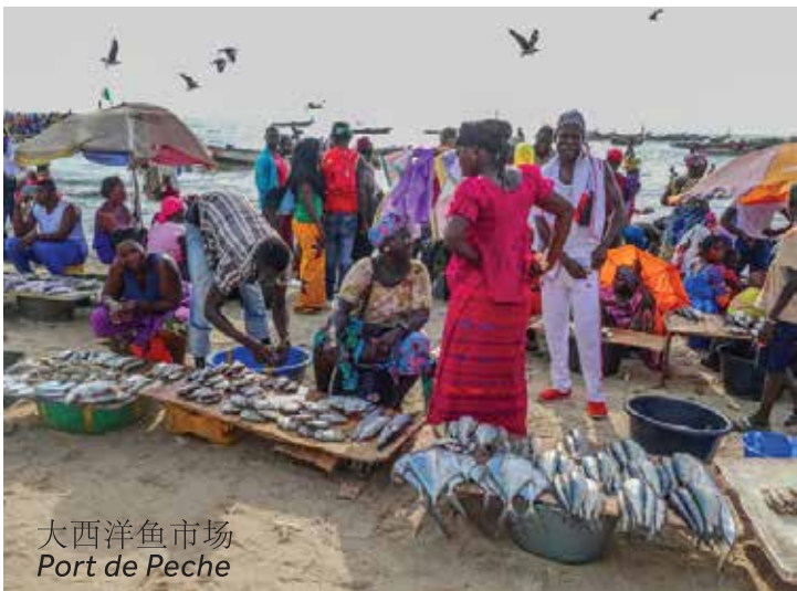
大西洋鱼市场 Port de Peche

惊叹于 骆驼市场 ，因为它是该市最独特的地方之一，也是整个非洲第二大骆驼市场。在尘土飞扬的大自然环绕的大片地区，有无数斜跪的骆驼，易货贸易商和嘈杂的拍卖会。你从来没有在一个地方见过这么多骆驼！