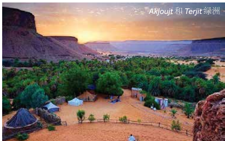
Akjoujt 和 Terjit 绿洲

泰尔吉特绿洲是一个宁静的地方，色彩缤纷。手工制作的地毯，棕榈树和水与帐篷作为对烈日保护，是沙漠中间一个非常需要的休息场所。在绿洲沙漠帐篷里过夜，里面有设施。