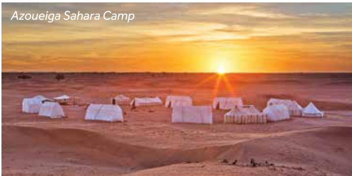
Azoueiga Sahara Camp

From Atar we will follow the track of the Paris Dakar Rally by the white valley to arrive at the highest dunes in Mauritania at Azoueiga . There we enjoy a wonderful night, sleeping in our own camp. It will be an amazing day where you will meet nomads of the Sahara who live in goat hair tents, eking out an existence like their forefathers & adhering to the traditions of the Sahara of old. The clarity of African skies at night is without comparison. The silence in the desert only adds to the overall experience.