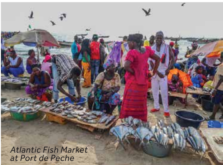
Atlantic Fish Market at Port de Peche

Be amazed at the Camel Market as is known for being one of the most unique places in the city and the second-largest camel market in all of Africa. There are countless leaning camels, bartering traders, and noisy auctions on a huge area surrounded by dusty nature. You've never seen so many camels in one place!