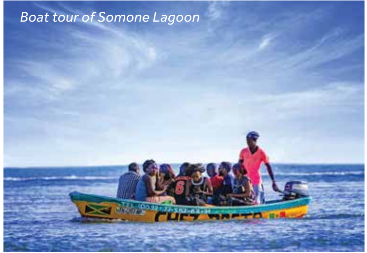
Boat tour of Somone Lagoon

Boat tour of Somone Lagoon. Time for shopping in the craft market and transfer to Dakar airport for flight home.