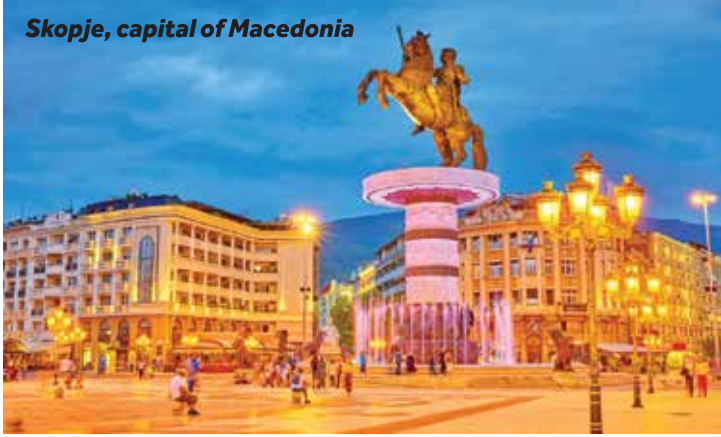
Skopje, capital of Macedonia

Depart for Skopje , capital of Macedonia . Skopje is a very attractive tourist destination with its fortress, cultural and historical monuments and archaeological sites.