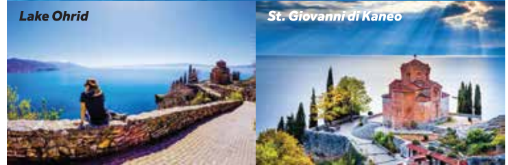
St. Giovanni di Kaneo