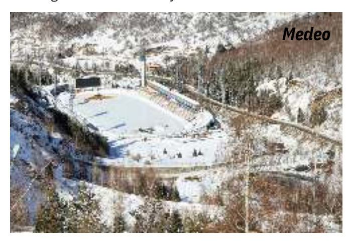
Day 3 Almaty, Kazakhstan (B/D)

In the morning, a city tour with Russian Orthodox wooden cathedral, wedding palace, circus and central mosque (from the outside). Lunch at the local yurt restaurant. In the afternoon, your journey with the special train begins. A welcome drink and a short lecture await you on board.