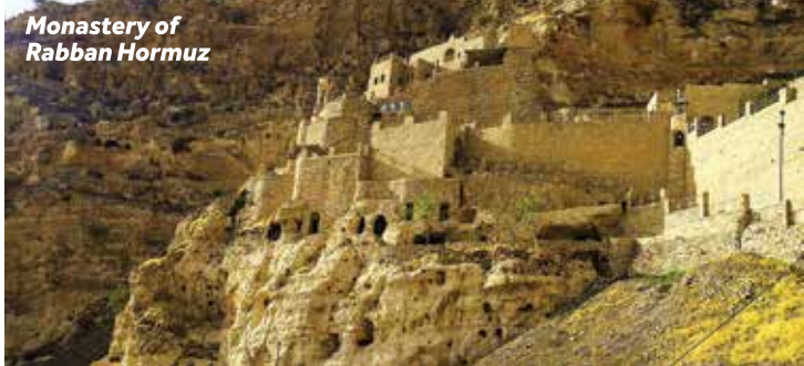
Monastery of Rabban Hormuz