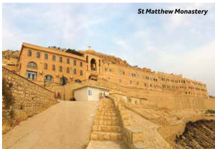
St Matthew Monastery

Walk to the Shanidar caves , an archaeological site. Overnight Erbil , the capital of Kurdistan.