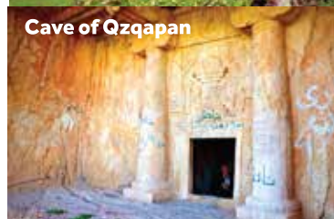
Cave of Qzqapan