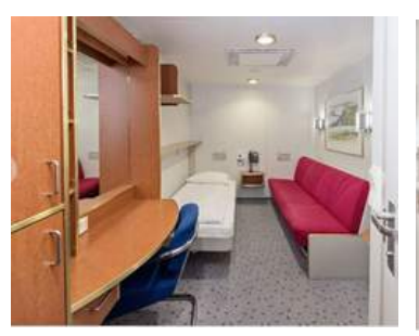
• 8-11 sqm or 86-118 sqft

Most luxurious cabins on the ship. Situated on the upper deck. The cabins feature seating areas with TV, All of the suites provide complimentary cabin kits, with bathrobe, slippers and more.