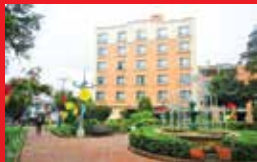
Bogotá Hotel Morisson 84 4* or similar (3 nights) ★★★★★☆