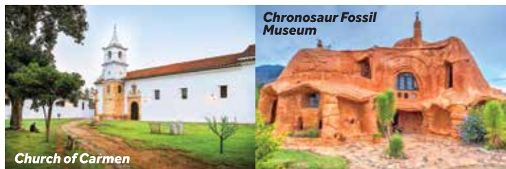
Church of Carmen

Villa de Leyva tour with the main square, the Church of Carmen, Ecce Homo Convent and the Chronosaur Fossil Museum where the Pliosauridae fossil of 115 millions years Cretaceous period is exhibited.