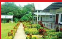
Caño Cristales Hotel Punto Verde 4* or similar (2 nights) ★★★★★☆