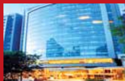
Medellin Hotel Estelar Milla de Oro 4* or similar (2 nights) ★★★★★☆