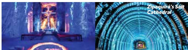
Zipaquirá's Salt Cathedral

Visit Zipaquirá's Salt Cathedral . A panoramic tour to see the Colonial architecture of Zipaquirá. Continue to Villa de Leyva , passing through small towns that date back to pre-Columbian times such as Tocancipá and Gachancipá.