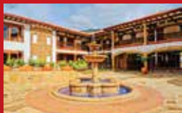
Villa de Leyva Hotel Campanario de la Villa 4* or similar (1 night) ★★★★★☆