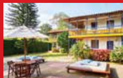
Armenia Hotel Hacienda Combia 4* or similar (2 nights) ★★★★★☆