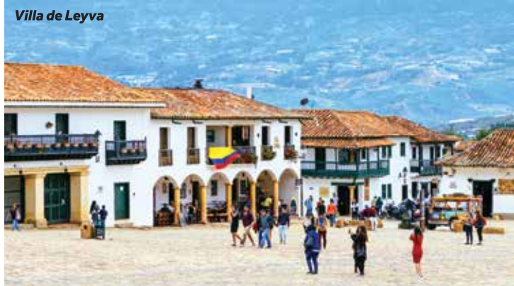
Villa de Leyva