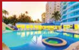
Cartagena Hotel Dann Cartagena 4* or similar (1 night) ★★★★★☆

*Note: Hotel subject to final confirmation. Should there be changes, customers will be offered similar accommodation to the list.