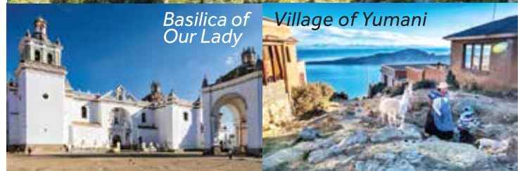
Basilica of Our Lady