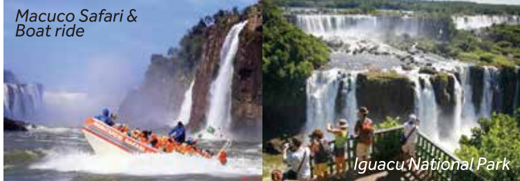
Macuco Safari & Boat ride