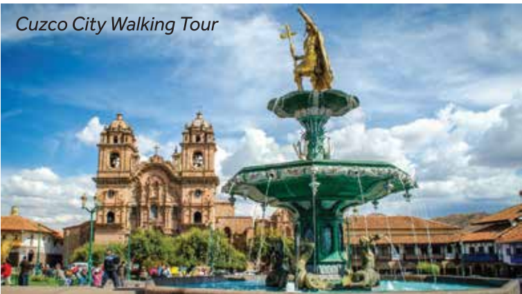
Cuzco City Walking Tour

You are free to explore on own the neighborhood of San Blas, known as the Artist's District. This bohemian quarter is home to art galleries, cafes, and several handicraft markets.