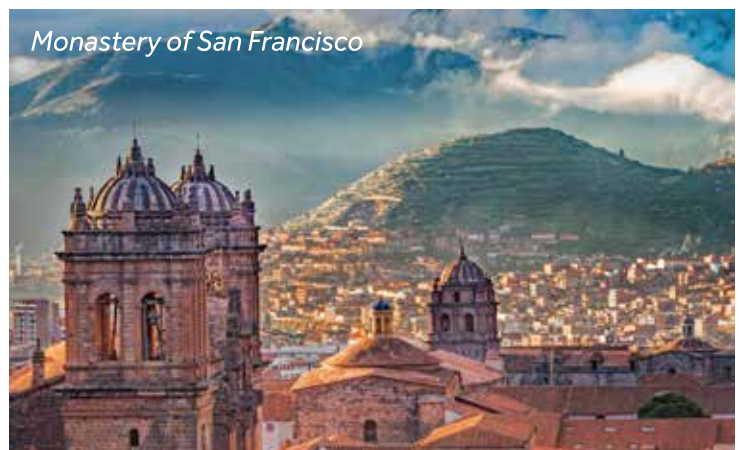
Monastery of San Francisco

Then, visit the Larco Museum , which holds the finest precious metals collection in Peru. Housed in a royal mansion of the 18th-century, the museum is famous for its gold and silver collection, its erotic archaeological collection, and its pre-Colombian art collection. There are over 45,000 objects, all classified by culture and theme in chronological order.