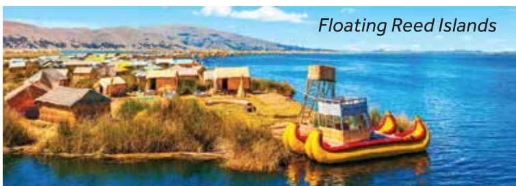
Floating Reed Islands

Take a boat trip to visit the floating reed islands of the Uros Indians and witness their unique way of life! These islands are made of piles of reeds, an ancient tradition of the Uros. They are descendants of the oldest people of the Altiplano, though the present Uros people have mixed with the Aymara and no pure Uros exist anymore.