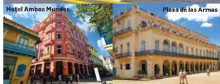
Hotel Ambos Mundos