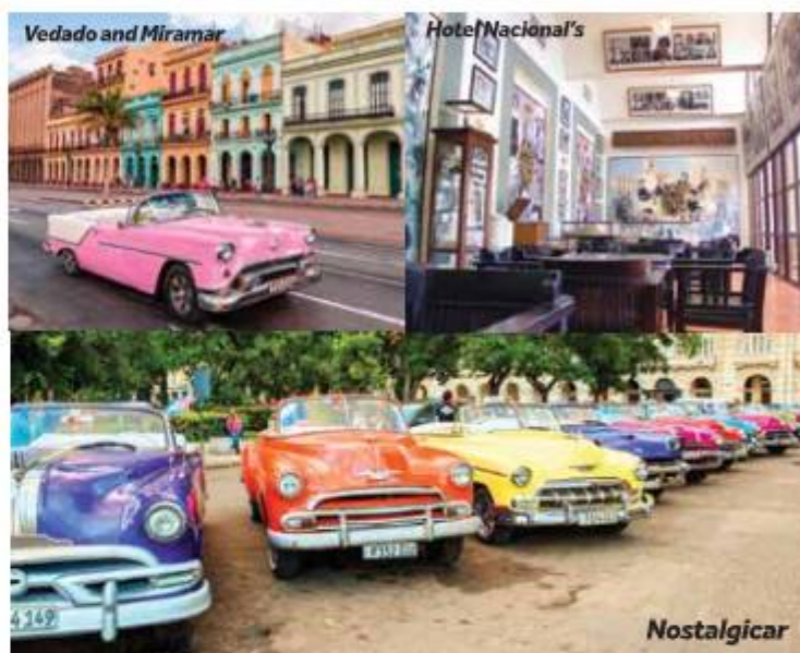
Vedado and Miramar

Visit Nostalgicar , the authentic workshop which still service the classic cars of Havana. Be amazed by their ingenuity and resourcefulness in keeping the cars in running order.