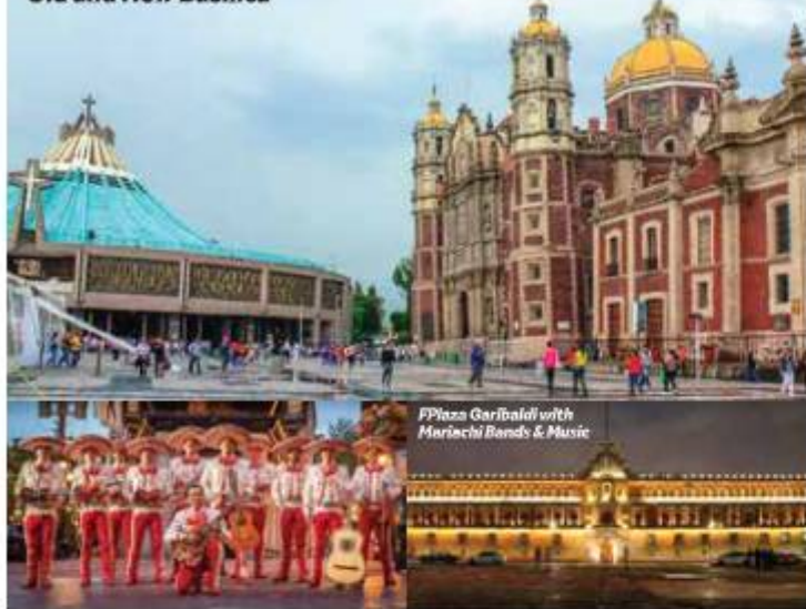
Plaza Garibaldi with Mariachi Bands & Music