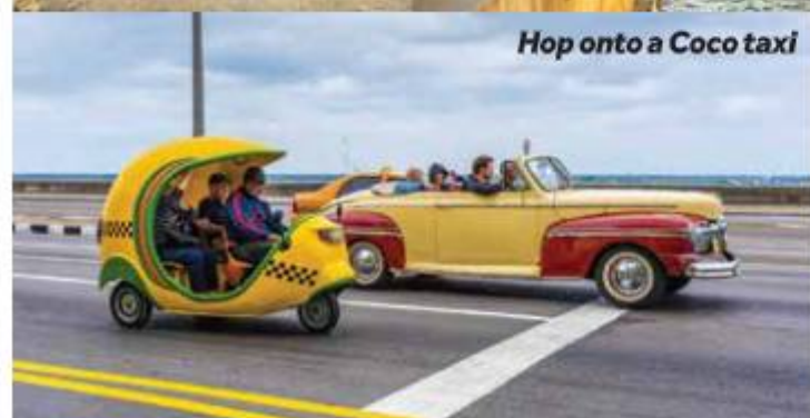
Hop onto a Coco taxi