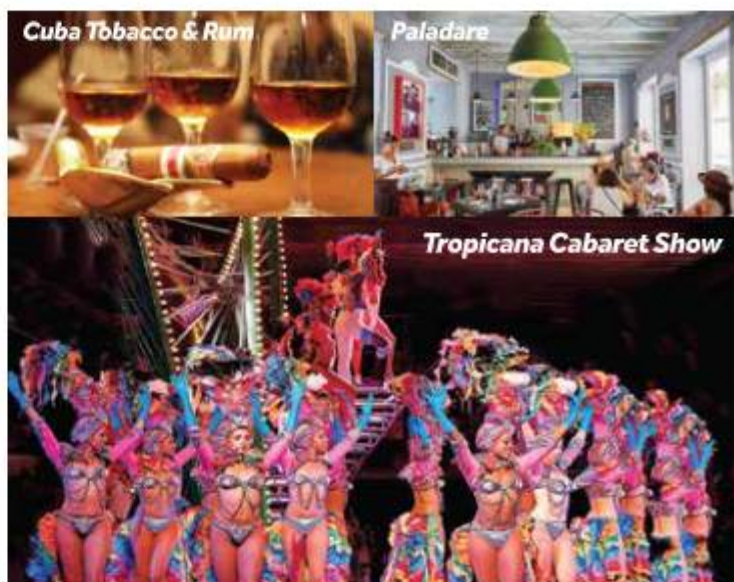
Cuba Tobacco & Rum

End the night at the famous Tropicana Cabaret Show . A nostalgic open-air show with more than 200 artists and live orchestra in a beautiful garden setting. Let yourself be seduced by the rhythms of Cuban music and by the charming dancers. It's a "must" when you are in Havana.