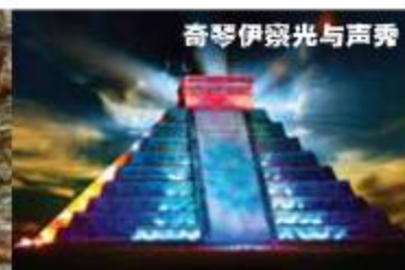
奇琴伊察光与声秀