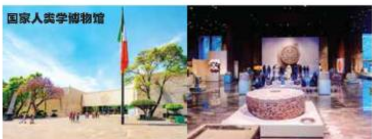
国家人类学博物馆

全景游览 墨西哥城历史中心 （联合国教科文组织遗址），参观 索卡洛主广场、大都会大教堂、美术馆和邮局 等景点。