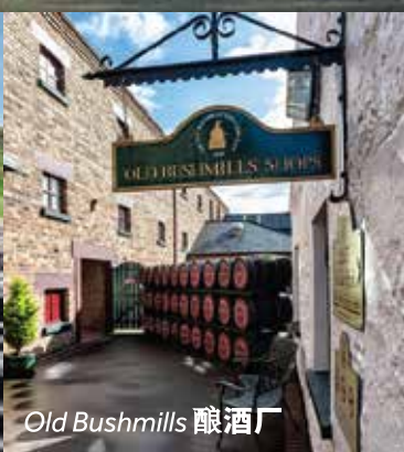
Old Bushmills 酿酒厂