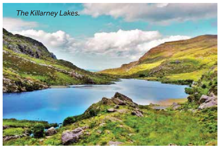
The Killarney Lakes.

Continue south this morning from Galway past the towering Cliffs of Moher towards Limerick , with an included visit to Bunratty Castle and Folk Museum en route. Here, visitors can see a recreation of 19th Century Irish village life. Then continue onto Ireland's most beautiful Lakeland country – The Killarney Lakes .