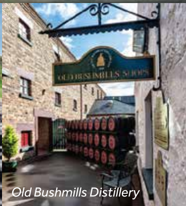
Old Bushmills Distillery